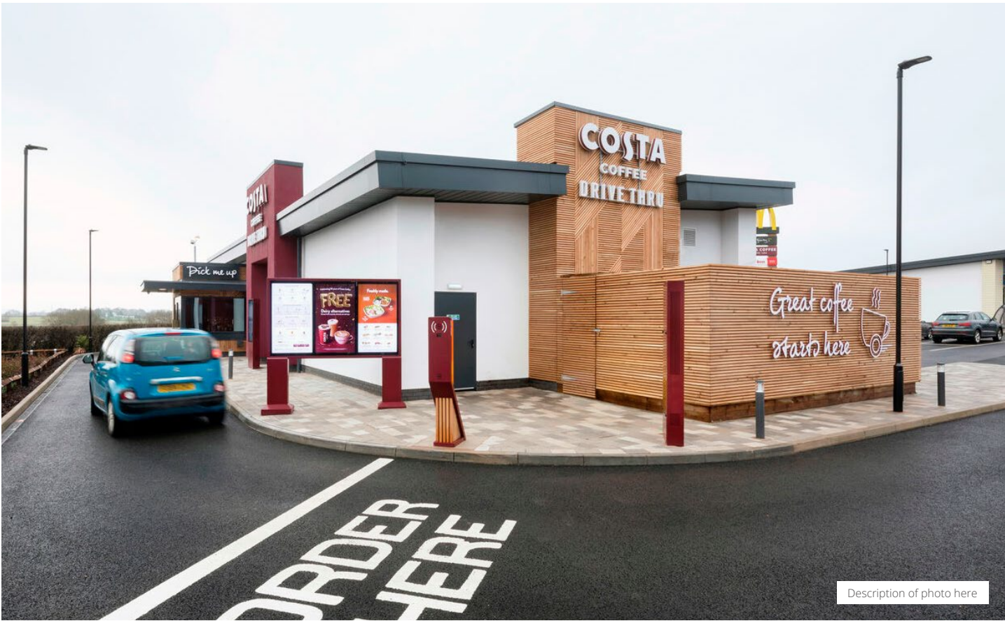
Description of photo here