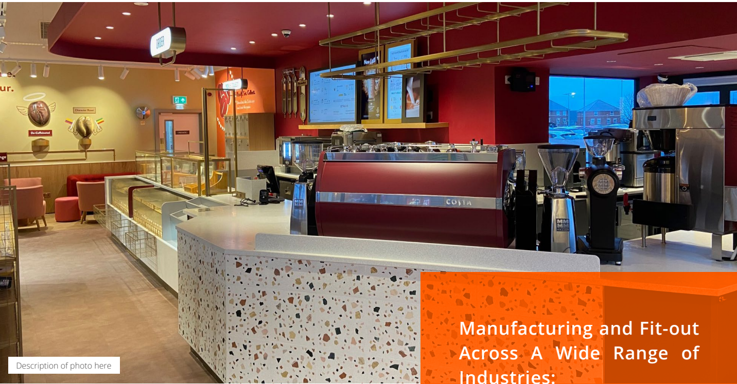
Description of photo here