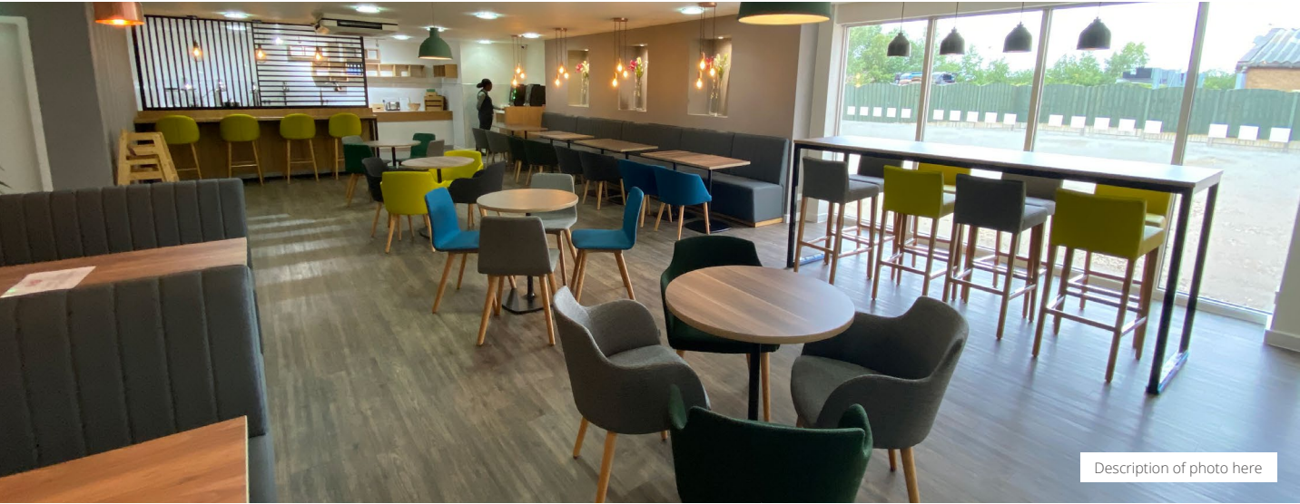
Description of photo here