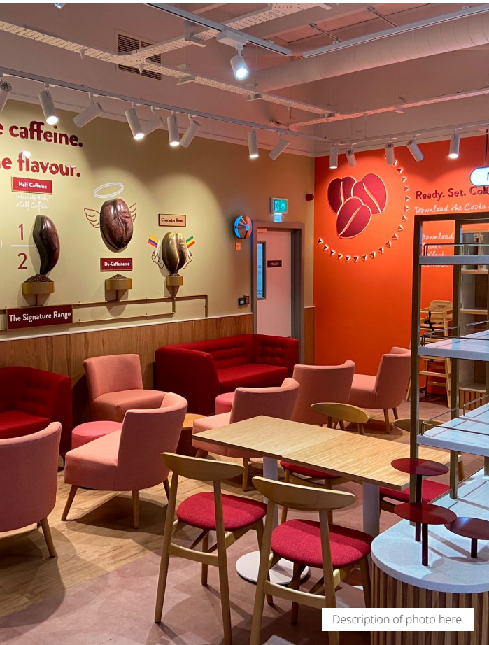
Description of photo here